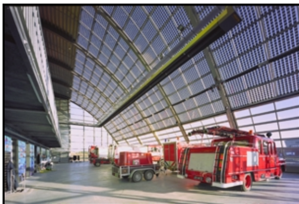
fig 1 Fire Station Houten, the Netherlands – PV integrated into the overall sustainability concept of the building

Based on the understanding of the need for international collaboration in the field of PV in the built environment towards long-term cost effectiveness as well as towards the development of concepts for the challenging