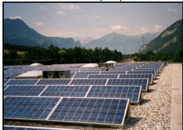
fig 1 Fire Station Houten, the Netherlands – PV integrated into the overall sustainability concept of the building

Project sizes are increasing. Customers are shifting from the Innovators to the Early Adopters, a new market